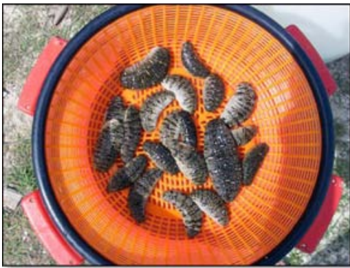
Figure 4. Hatchery-reared juvenile H. scabra .