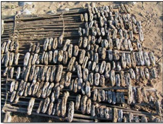
Figure 2. Wild sea cucumbers drying in a Vezo village.