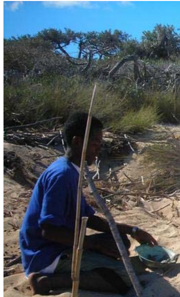
Turtle guard, Madagascar.

"We thought there were no turtles nesting here anymore. But saving this nest has prompted the village to help preserve a species," says Gough. "Our experience of work in this region is that when one village chooses to do something, others follow. Village presidents from elsewhere are already showing an interest in the turtle project."