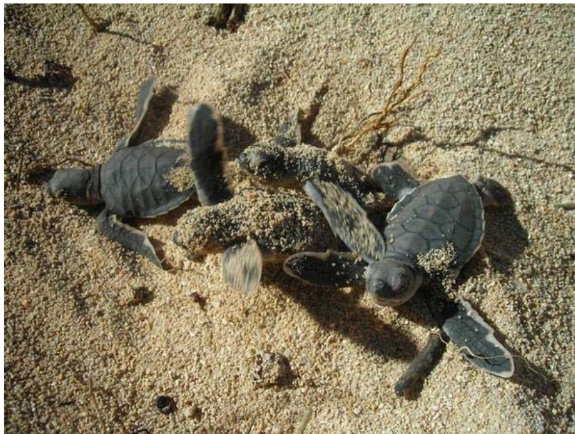
Green turtle hatchlings in Madagascar.